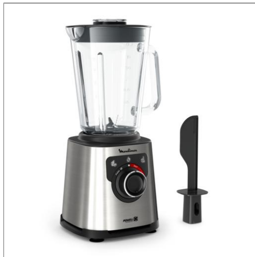
Moulinex Perfect Mix + High Speed Blender HSB PERFECTMIX+ SS W/O ACC LM871D10